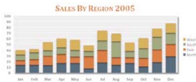
Figure 2.1—Nationwide Real Estate Sales by Region in 2005

Visuals or infographics may depend on text to provide context ; that is, associated text clarifies the purpose of the visual and integrates it into the document. The caption below a visual often serves this purpose, as in this example: