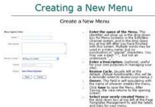
Figure 2.2—Screenshot example to illustrate a task

Screenshots are used often in software documentation, to provide a visual reference to the task or process. They are an actual graphic image of what the computer screen would look like during that task. This graphic combines text and a visual screenshot to explain a task.